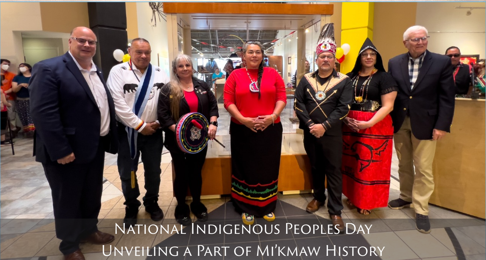
NATIONAL INDIGENOUS PEOPLES DAY UNVEILING A PART OF MI'KMAW HISTORY